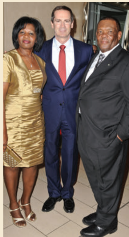
At the Helmets to Hardhats fundraiser from left to right: