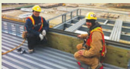
Parapet wall forensic Keele and Wilson