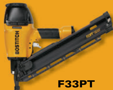
F33PT 33° Paper Tape Collated Framing Nailer

We're not afraid of a challenge. The BOSTITCH framing nailers are ready to tackle any job you put before them. Engineered lumber? No problem. Our nailers tout a staggering power-to-weight ratio. Forgot your tape measure? Relax...we've got you covered with a 16" layout indicator. These tools deliver the features that matter most to pro's. On the jobsite, it's survival of the fittest. We're up for that challenge, are you?