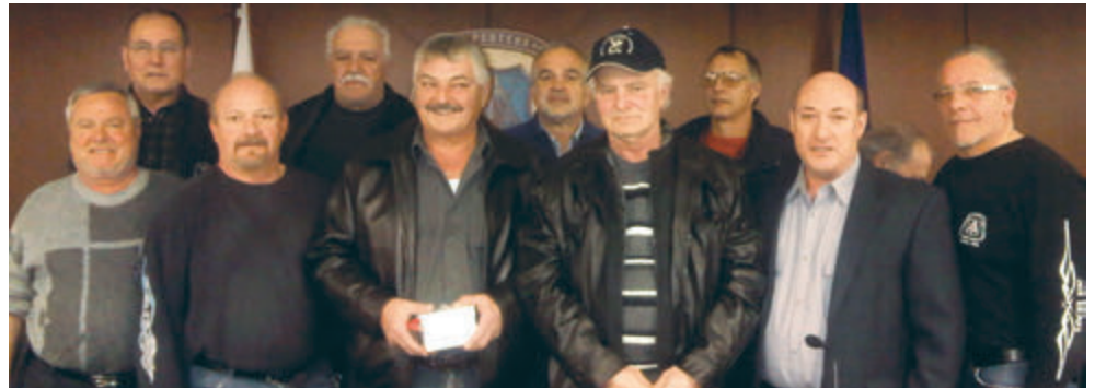
Local 675 Retirees receiving their watch during the November 2011 Meeting