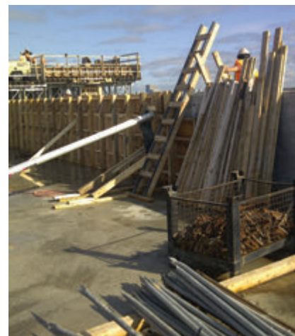
Verdi Bridgepoint Rooftop planter boxes, hard landscaping