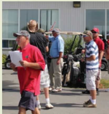
This year's golf tournament was July 28, 2012