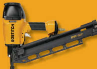
F21PL 21° Plastic Collated Framing Nailer