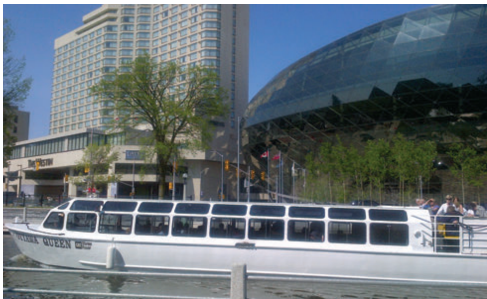
Ottawa Convention Centre