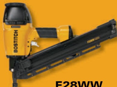
F28WW 28° WireWeld Collated Framing Nailer